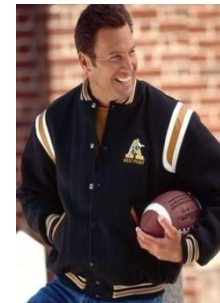
JACKET (D) 503: WOOL WITH LEATHER INSERTS $230.00