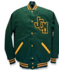
JACKET (A) 5100: ALL WOOL $145.00

this is a stock jacket from the mill leather and vinyl sleeves