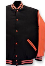
JACKET (B) 5000: WOOL WITH LEATHER SLEEVES $250.00