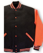
JACKET (C) 5200: WOOL WITH VINYL SLEEVES $195.00